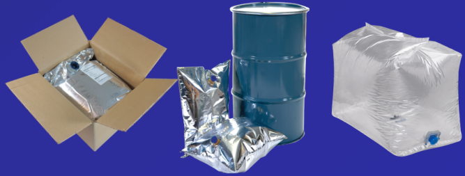
INDUSTRIAL PACKAGING 20 kg , 200 kg , 1,000 kg