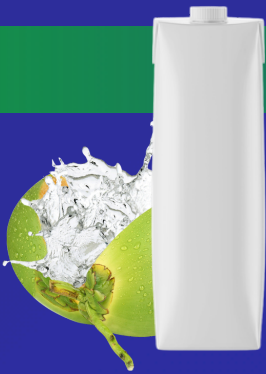
PREMIUM PRISMA 1,000 ml