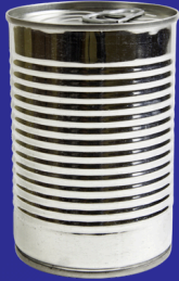
CANNED 400 ml